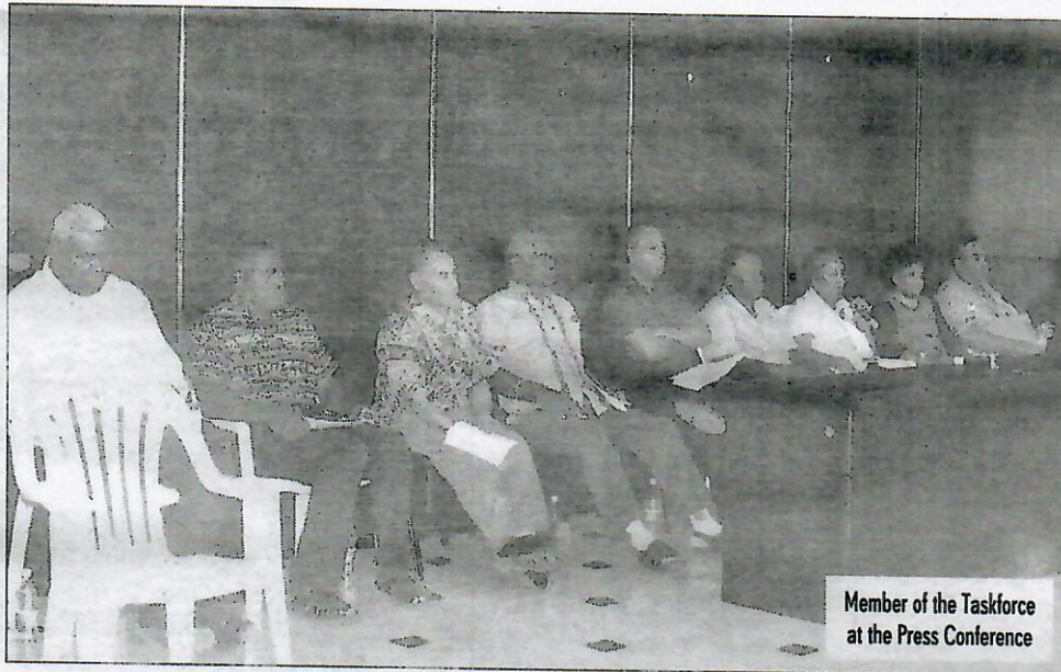
Member of the Taskforce at the Press Conference

Since the Chinese nationals were deemed wanted persons in China, their removal was guaranteed under the 'removal without notice' order which warranted the law enforcement officers to execute instant deportation.